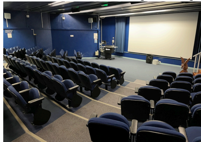
Capacity: 133 Film Theatre