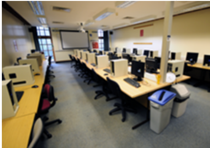
Capacity: 27 Computer Room