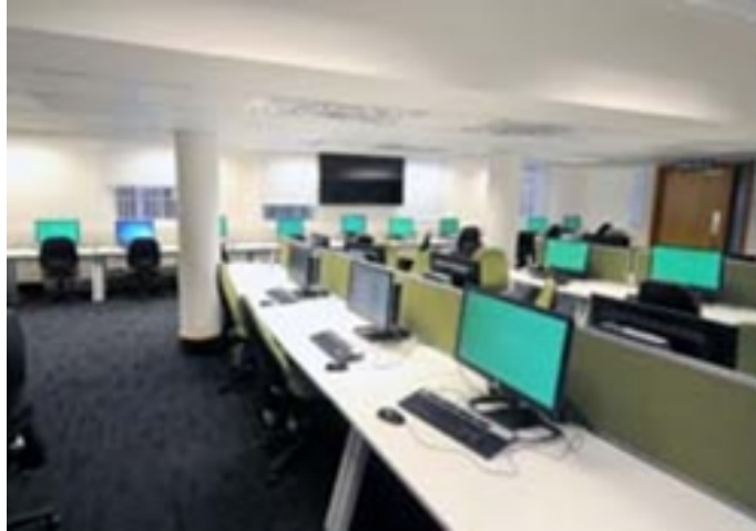
Capacity: 35 Computer Room