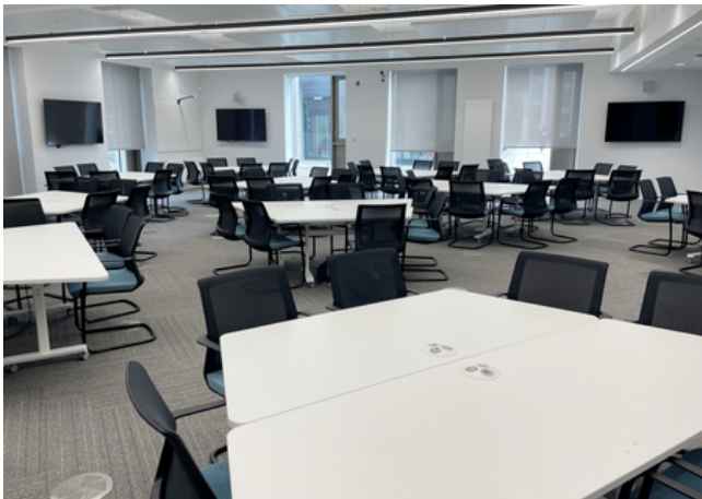
Capacity: 84 (same layout as 0.02 but no photo available)