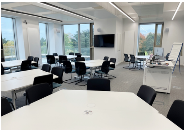
Capacity: 30 (same layout as 2.07 but no photo available)