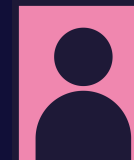
Ajit Arjun Pawar