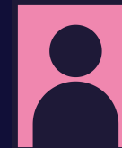
Ajit Arjun Pawar